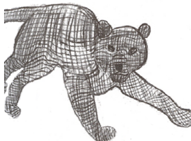
Original drawing of animal using organic form.